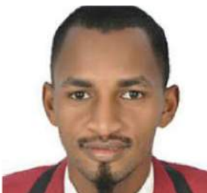
SADDAMANNOUR TRÉBO SECRETARY FOR EDUCATION AND STUDENTS RIGHTS